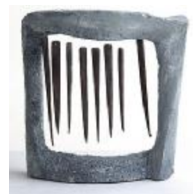
Parasto Ahuan (Iran)