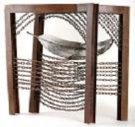
Batool Mokhtary (Iran)