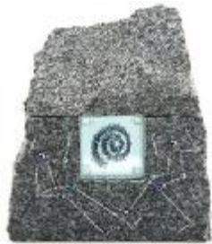
Mensoud Keco(Bosnia Herzegovia)