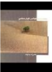
Iranian Art Publishing Books