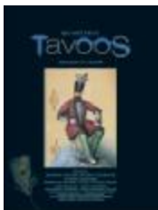
Iranian Art Quarterly Magazines