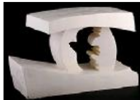
Yang Jinhuan (China)